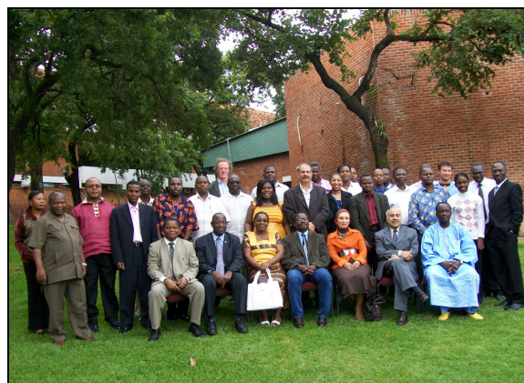
Participants of the FISHNET meeting