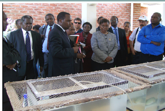
The Honorable Deputy Minister Margaret Mauwa (center) views aquaculture displays during the launch.

Other related articles can be accessed on www.scidev.net/en/news (26 February 2010) and Malawi's Local Newspaper, The Sunday Times of February 28, 2010.